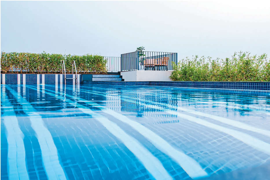
Purti Hastings, Kolkata

And it's not just a visual upgrade, it's backed by